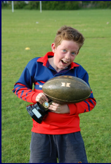
Minis Section Chairman's Player of the Season

Congratulations to all those that won awards this year.